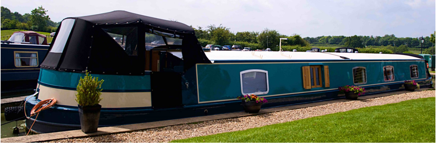
Guide to layout . Not to scale

62 ft x 12 ft • Aqualine Canterbury • 2015 • Widebeam